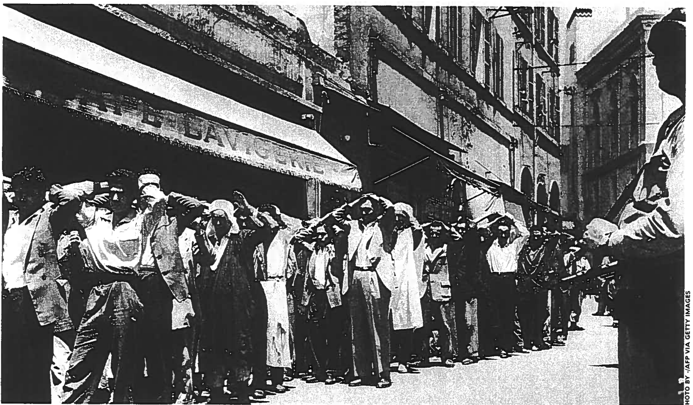
Suspects, hands on their heads, are taken to the central police station in Algiers on June 10, 1956, during a raid in the Belcourt and Lower Casbah neighborhoods, triggered by the French authorities, following attacks that took place in the capital, during the Algerian War.

IN NOVEMBER 1954 , just months after being forced to acknowledge defeat in its war to retain control of Indochina, France found itself facing a new revolt in Algeria. The National Liberation Front (known as FLN, the abbreviation of its French name) had launched a campaign of guerrilla warfare with the aim of winning independence for the country.